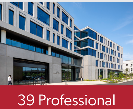
39 Professiona Engineers